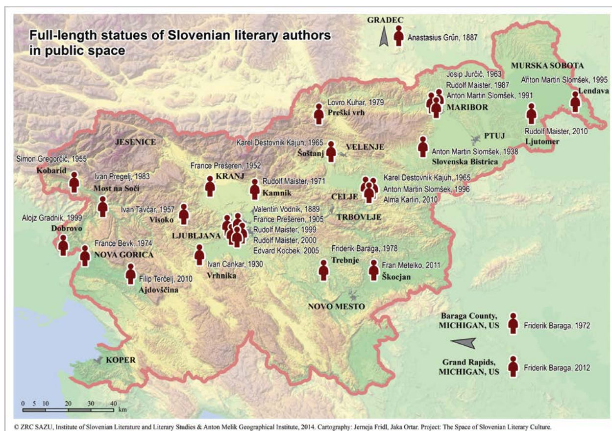
Map 1: Full-length statues of Slovenian literary personae